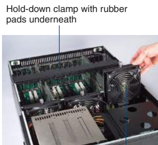
Three 114 CFM hot-swappable cooling fans