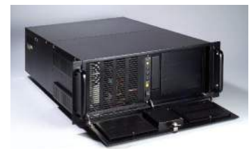
Front panel appearance with single power supply configuration