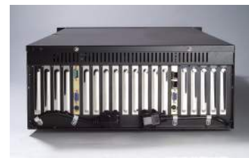
Dual AC power cord for 460 W / 570 W / 810 W redundant power supply