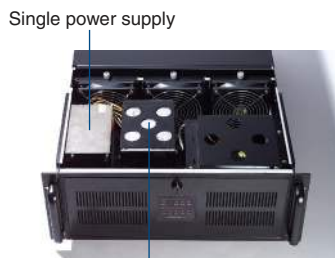
Extra drive bay which can hold up to three 3.5" HDDs