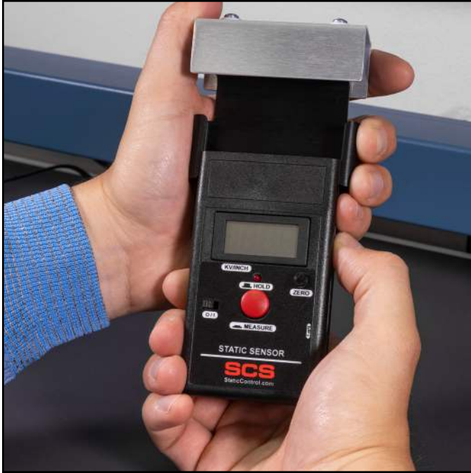
Figure 8. Sliding the Conductive Plate onto the Static Sensor