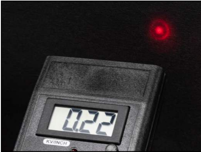
Figure 7. Aligning the two bullseyes emitted by the LED range indicator