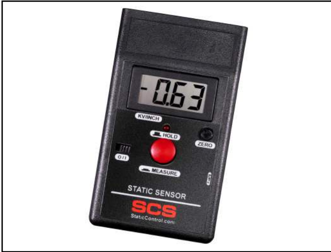
Figure 1. SCS 770716 Static Sensor