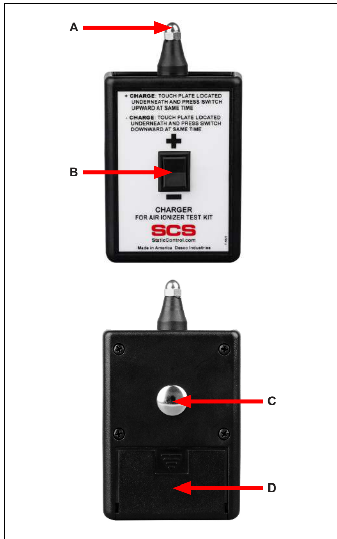
Figure 5. Charger features and components

A. Output Contact: The output contact is connected to an internal power source. When the touch plate located underneath the unit is connected to ground, the output contact will provide a charge of the indicated polarity. The charger is designed so that an operator can press the rocker switch and touch the plate simultaneously with the fingers of the same hand.