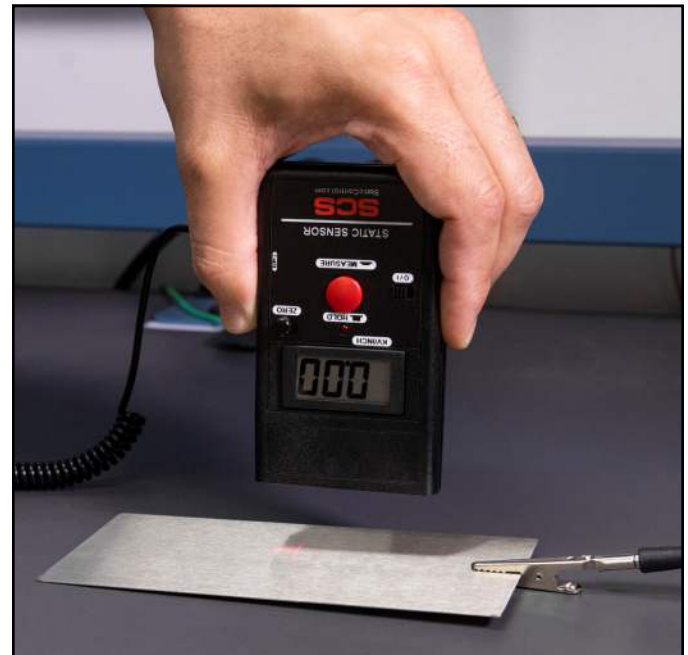
Figure 6. Pointing the Static Sensor to a grounded surface

Slide the power switch to the right to power the Static Sensor. Point the top of the Static Sensor approximately 1 inch (2.5 cm) away from a grounded metal surface. Proper spacing is indicated when the two red bullseyes emitted LED range indicator become centered on top of each other. Turn the rotary zero knob until the Static Sensor's display reads 0.00.