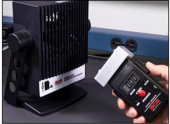
Figure 9. Using the Static Sensor with Conductive Plate to measure the offset voltage of a benchtop ionizer

NOTE: When testing pulsed ionizer systems, the voltage displayed is constantly changing. This pulse rate may be faster than the display update rate of the Static Sensor, therefore the displayed voltage is an average of the actual voltage. The output of the Static Sensor is useful in this situation for more accurate measurements.