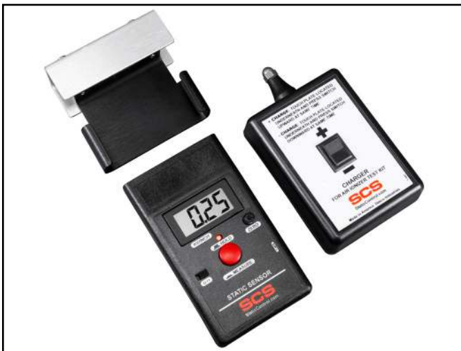
Figure 2. SCS 770717 Air Ionizer Test Kit