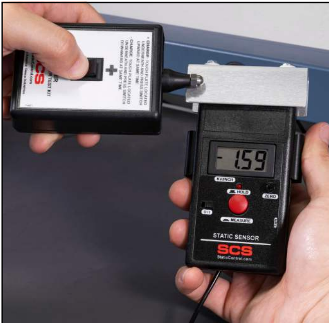
Figure 10. Using the Charger to apply a charge onto the Conductive Plate

NOTE: A ground path must be provided between the touch plate of the Charger and the ground reference of the Static Sensor. This is normally provided by holding the Charger in one hand and the Static Sensor with Conductive Plate in the other.