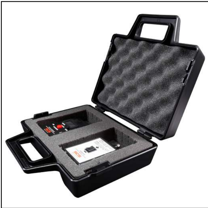
Figure 3. Air Ionizer Test Kit and Carrying Case