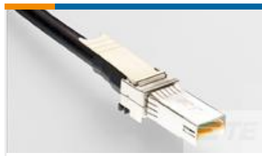
TE Part # 2142970-4 CABLE ASSY, MICRO SFP+ TO STD SFP+, 3M