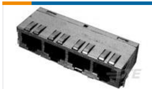
TE Part #1-5406203-2 MJ,ASSY,4P,8POS,CAT5,PNL TABS,.1S /T