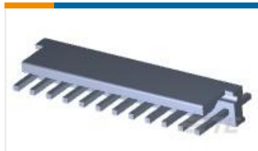
TE Part #4-644759-2 12P MTA156 HDR ASSY STR LF