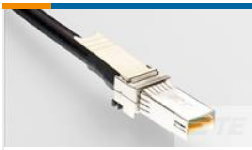
TE Part # 2142970-2 CABLE ASSY, MICRO SFP+ TO STD SFP+, 1M