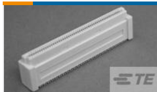
TE Part #5084618-1 0.8FH,R13H.5,040,30/Sn,TR,SC