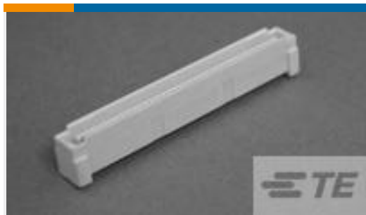
TE Part #6123001-1 0.8FH,P08H.5,040,30/Sn,TR,SC