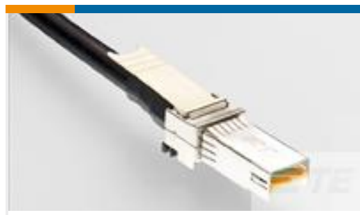
TE Part # 2142970-3 CABLE ASSY, MICRO SFP+ TO STD SFP+, 2M