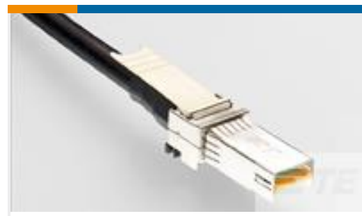
TE Part # 2142970-5 CABLE ASSY, MICRO SFP+ TO STD SFP+, 4M