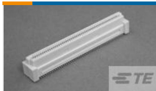
TE Part #7-5179180-3 0.8FH,R09H.5,080,30/Sn,TR,SC