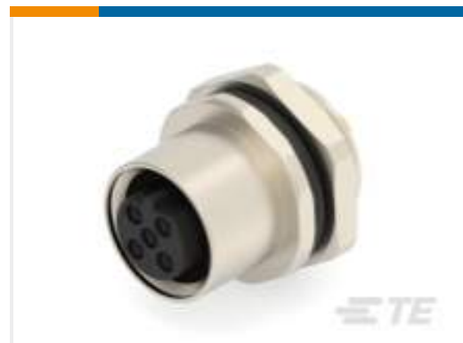
TE Part #T4133412051-000 M12, FRONT MOUNT, FEMALE, B, 5P, SOLDER WIRE