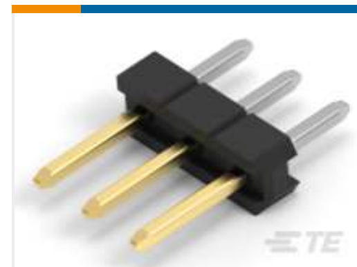
TE Part #2355181-4 4P, 2MM, BRK HDR, SRVT, 2.8, 0.38AU, BOX