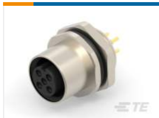
TE Part #T4143012051-000 M12, FRONT MOUNTING, FEMALE, A CODE, 5P