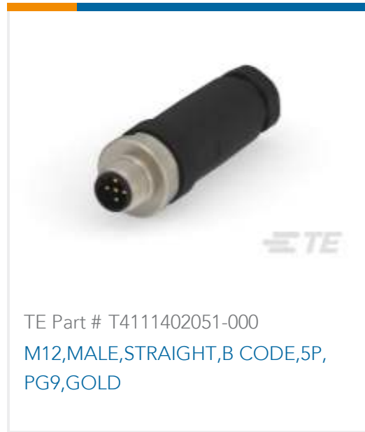
TE Part # T4111402051-000 M12, MALE, STRAIGHT, B CODE, 5P, PG9, GOLD