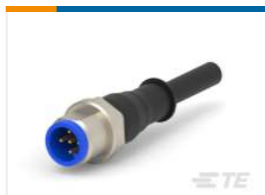
TE Part #1-2273046-1 M12 A-Code Male Straight Pigtail