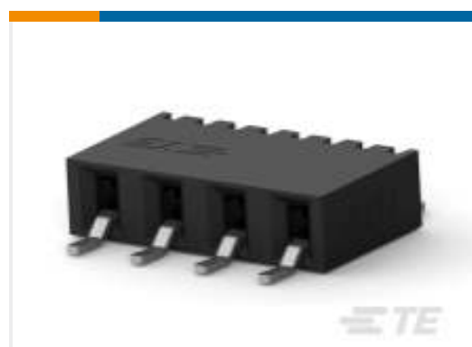
TE Part #2307725-4 4P, 2MM, B-B, REC, SRHZ, SMD, 0.1AU, TR