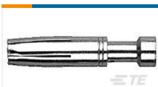
TE Part #3-1105101-1 HE/HA-C-BU.AG.1,5