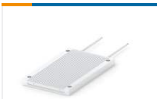
TE Part #1-2176250-4 TJT 500W 150R 5%