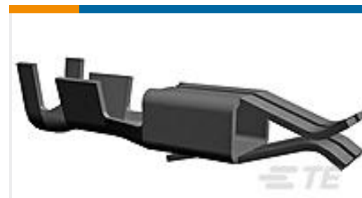
TE Part #927973-3 JUNIOR-TIMER KONT