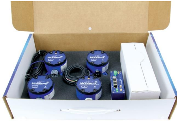
Figure 2. Repackaging the Kit