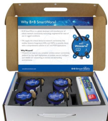
Figure 1. Kit Contents

The Wzzard Design and Development Kits come in a handy enclosure. The package as shipped is shown below: