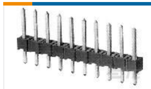
TE Part #826936-3 3P AMPMODU II STIFT LEI