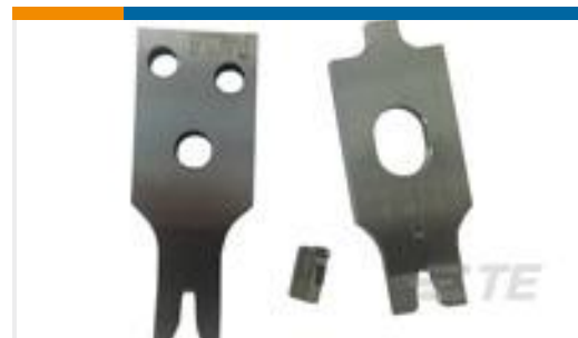
TE Part #7-2151079-7 OCEAN_2.0_SPARE_PART_KIT-080F130F