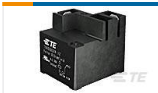
TE Part #3-1393210-3 T9AS5D12-12