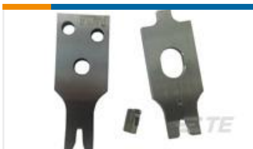
TE Part #7-2151852-7 OCEAN_2.0_SPARE_PART_KIT-110F160F