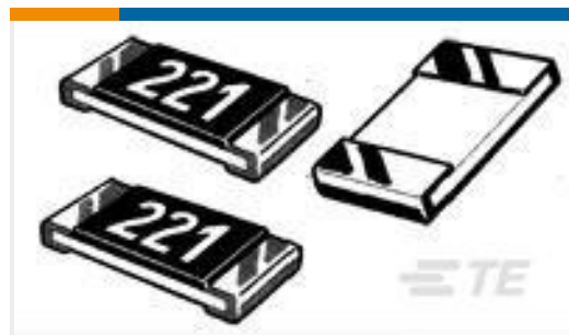
TE Part #3-2176230-6 3522 680R 5% 3W