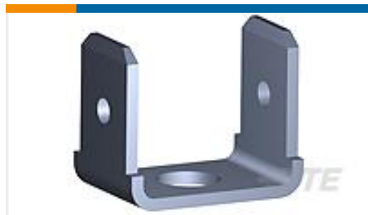
TE Part #141878-2 250 FASTON,TAB,TPBR