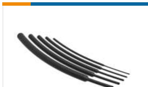
TE Part #NB19392001 RNF-100-3/16-BK-STK