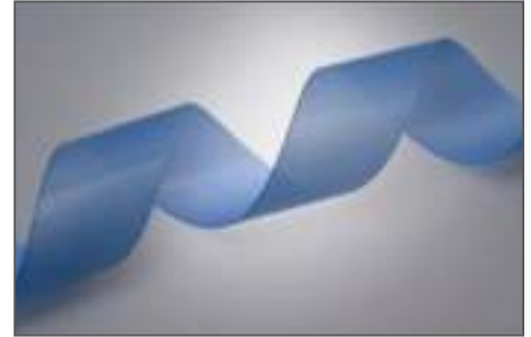
Temp-Flex FEP MIL-Spec Approved Flat-Ribbon Cable

Commercial FEP Flat-Ribbon Cable, MIL-Spec Approved FEP Flat-Ribbon Cable