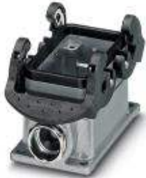
Box mounting base, with double locking latch, height 52 mm, with screw connection, 2x Pg16

Please be informed that the data shown in this PDF Document is generated from our Online Catalog. Please find the complete data in the user's documentation. Our General Terms of Use for Downloads are valid ( http://phoenixcontact.com/download )