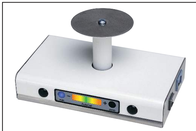
Figure 1. EMIT Auto Calibration Unit, Item 50610.