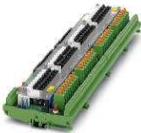
VARIOFACE output module, 32 channels for Yokogawa ADV 551, ADV 561 output modules.

Please be informed that the data shown in this PDF Document is generated from our Online Catalog. Please find the complete data in the user's documentation. Our General Terms of Use for Downloads are valid ( http://phoenixcontact.com/download )