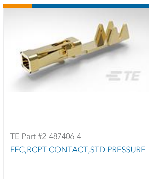
TE Part #2-487406-4 FFC,RCPT CONTACT,STD PRESSURE