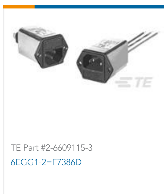
TE Part #2-6609115-3 6EGG1-2=F7386D