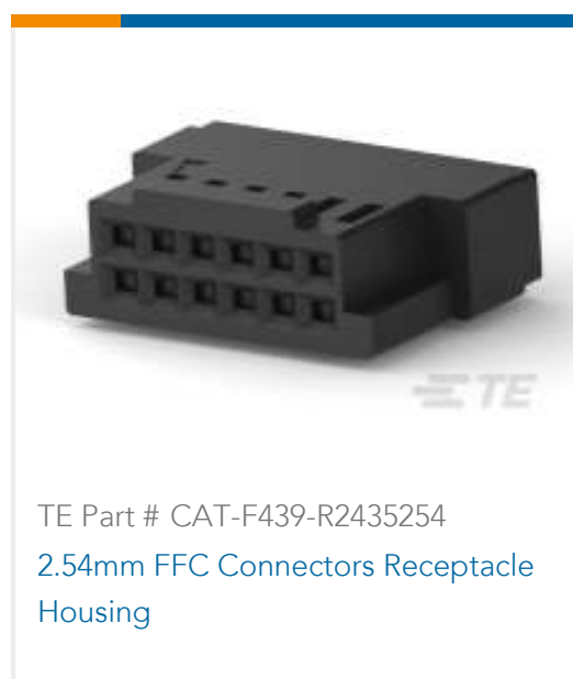
TE Part # CAT-F439-R2435254 2.54mm FFC Connectors Receptacle Housing