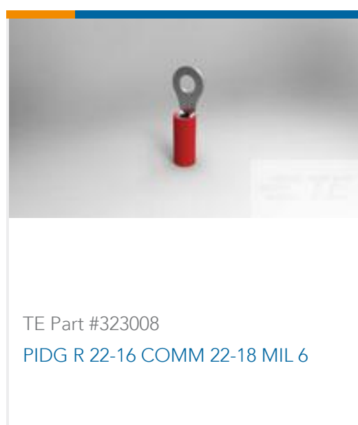
TE Part #323008 PIDG R 22-16 COMM 22-18 MIL 6