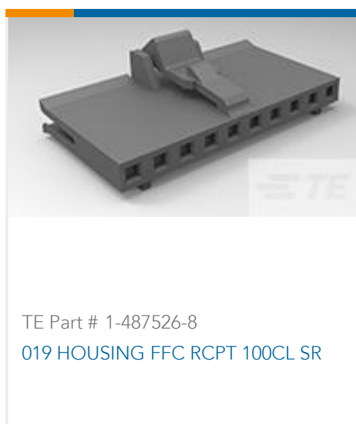
TE Part # 1-487526-8 019 HOUSING FFC RCPT 100CL SR