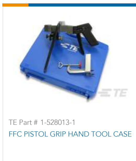
TE Part # 1-528013-1 FFC PISTOL GRIP HAND TOOL CASE