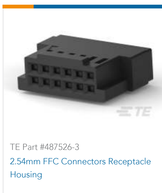
TE Part #487526-3 2.54mm FFC Connectors Receptacle Housing