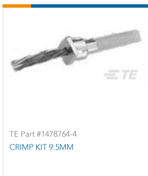
TE Part #1478764-4 CRIMP KIT 9.5MM