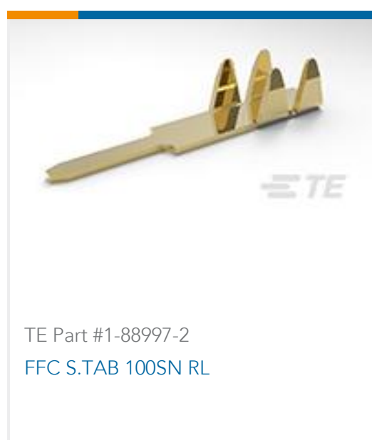
TE Part #1-88997-2 FFC S.TAB 100SN RL