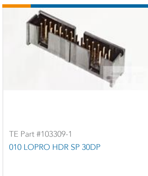
TE Part #103309-1 010 LOPRO HDR SP 30DP