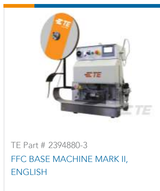
TE Part # 2394880-3 FFC BASE MACHINE MARK II, ENGLISH