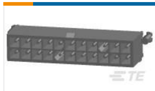
TE Part #1-794078-0 22P MINI UMNL HDR W/O DH SN LF