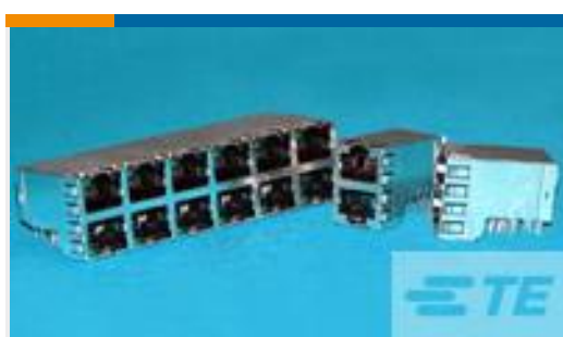
TE Part #6368035-3 2X6 OFFSET STK MJ,SHLD,G/YLED