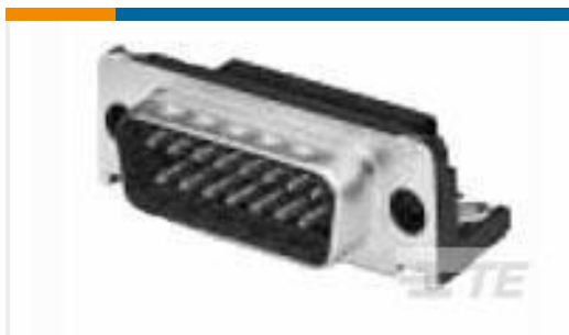
TE Part #5788793-2 09 HTMSFL PLUG RA 318 (SL,BL)