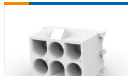
TE Part #2029451-1 06P UMNL SOK HDR ASSY W/O DRNS