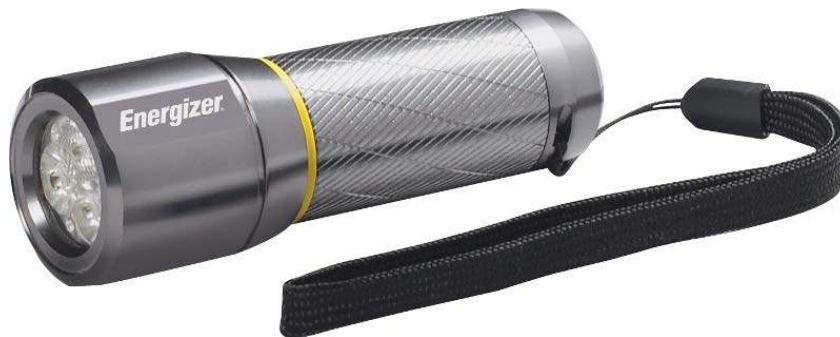
Tested according to ANSI/NEMA FL1 Standards. Results based on: Energizer ® MAX® Alkaline E92