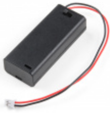
micro:bit Battery Holder - 2xAAA (JST-PH)

As a minimum, you're going to need a battery holder or JST-PH cable to go with your power board: