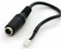
Barrel Jack to 2-pin JST