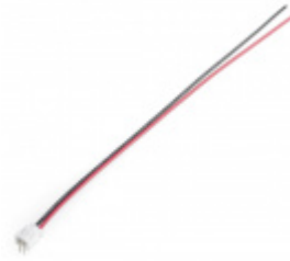
JST Jumper 2 Wire Assembly