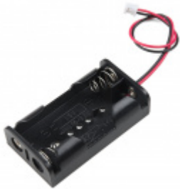
Battery Holder - 2xAA (JST-PH)