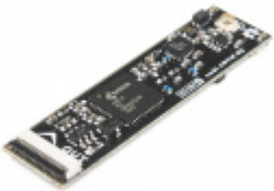
smôl ARTIC R2

The Power Board AAA is part of the smôl ecosystem. Why not pair it with one of the smôl Processor Boards and a Peripheral Board?