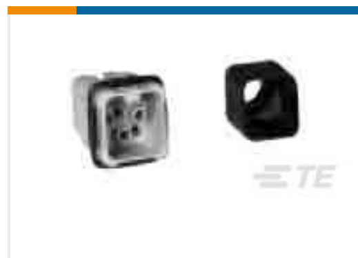
TE Part #2-1103104-3 HN.D.8.STI.C