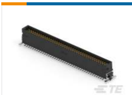
TE Part #244858-E SMCQ 80 M AB VV 8-03 CL * H007 137 E005