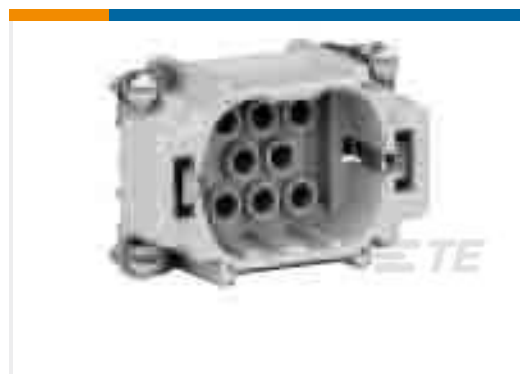
TE Part #2-1104020-3 HVT.8.STI.C.SO-SB