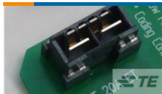
TE Part #2042274-2 ELCON MINI 2P VERT HEADER,W/O CODING