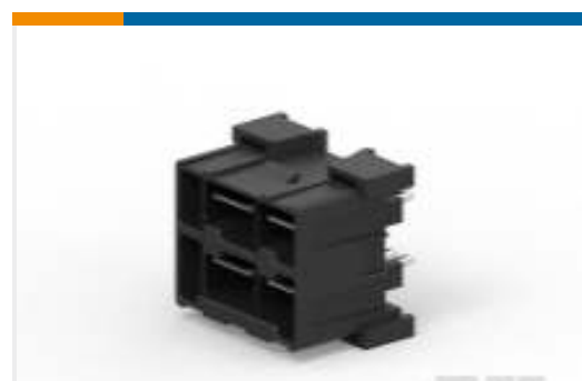
TE Part #2173132-2 ELCON MINI 4P VERT HEADER, UNSHIELDED,P/F