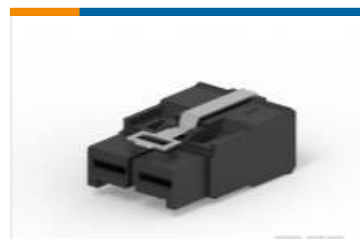
TE Part #2178186-3 ELCON MINI 2P CABLE CONN,6MM2, W/ (B)