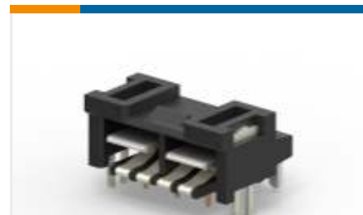
TE Part #1982295-1 ELCON MINI 2P RA HEADER, W /CODING