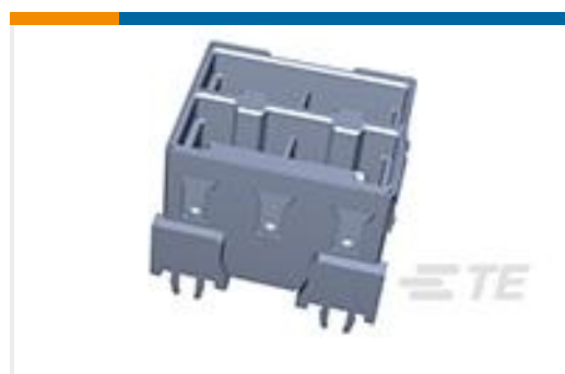
TE Part #2173211-1 ELCON MINI 4P VERT HEADER, SHIELDED,SOL