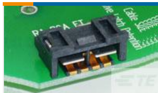
TE Part #1982295-2 ELCON MINI 2P RA HEADER,W/O CODING