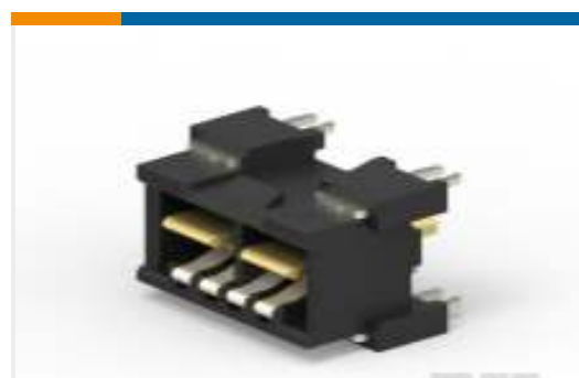
TE Part #2042274-6 ELCON MINI 2P VERT HEADER,PRESS-FIT,W/O