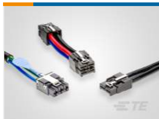
TE Part #2304890-1 CA,ET, 4POS, NO PULL-TAB,NO DETECT,SHIEL