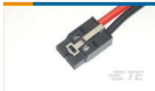
TE Part #1982299-4 ELCON MINI 2P CABLE CONN,W/O CODING