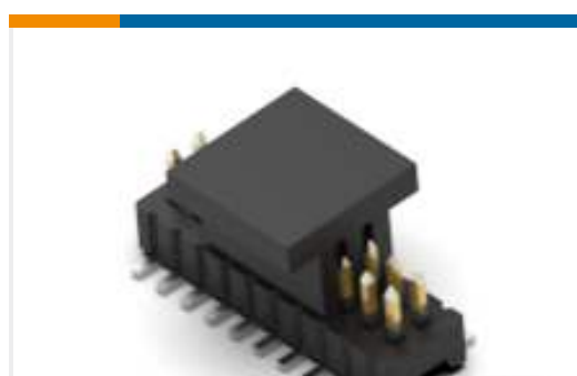
TE Part #1-2331928-0 SCL 1.0 HDR DRVT USP 020 SMT G1 TBK