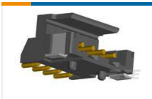
TE Part #2-292173-6 CT BOX HDR H SMT 6P O/TAPE BLA