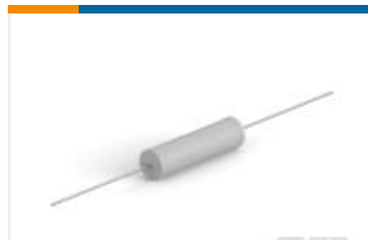
TE Part #1-2176414-0 7W STD M/OX 5% 47R