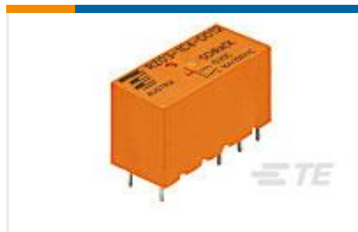
TE Part #3-2158000-5 RZ01-1A4-D005-R