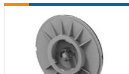
TE Part #2213831-2 BASE ASSY, 80MM, VENTED, SEALED