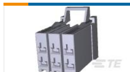
TE Part #1318095-1 DYNAMIC D-3500 REC HSG 6P