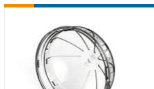
TE Part #1-2328823-1 LUMAWISE S 80MM DIA DOME CLEAR LOW