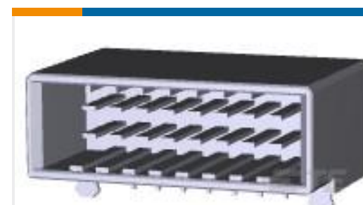
TE Part #178307-2 DYNAMIC D3100 HDR ASSY 16P