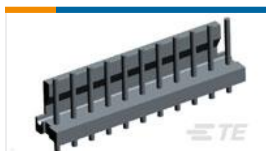
TE Part #1-640388-1 11P MTA156 HDR ASSY RN STR F/L