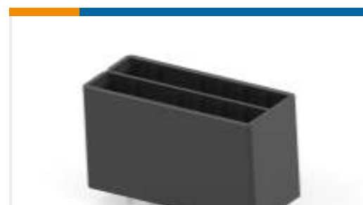
TE Part #1-178139-2 Header Assembly: Wire-to-Board, 15A, gold or tin plated