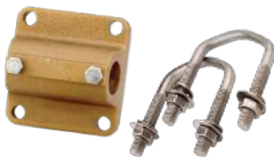
Heavy-Duty Mounting Kit Included