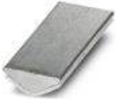
Insertion profile, Color: silver