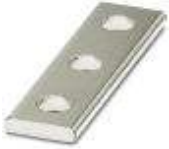
Connection rail, Color: silver