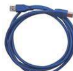
USB 3.0 cable