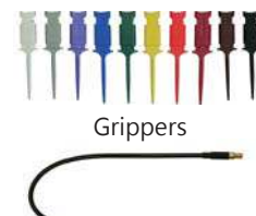
Grippers Stack cable