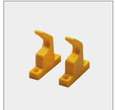
Wall holder set Order No. 29.00 00 70