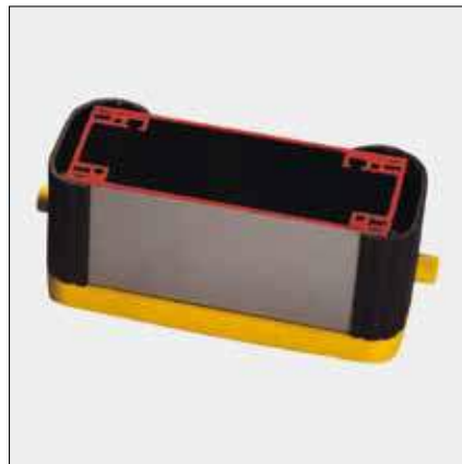
Inner T-slots offer mounting facilities on all sides