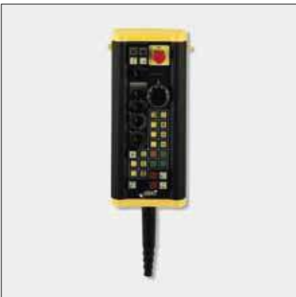
Pilot with small control device