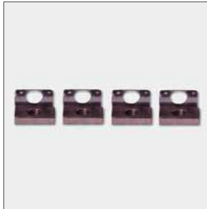
Set of spring nuts Spring nuts (M4) for internal mounting; set = 4 pcs Order No. 29.00 00 50