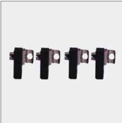
PCB fixing set Set = 4 pcs with spring nuts Order No. 29.00 00 60