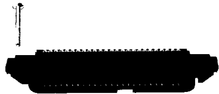
Screw Lock Hardware Kit Part No. 229911-1 (Two required per assembly)

Only fastening hardware supplied, other items shown for reference purposes.