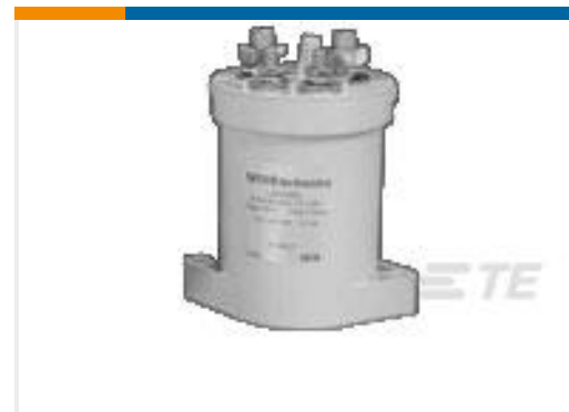
TE Part #7-1618387-1 LEV200A5ANA=RELAY, SPST-NO