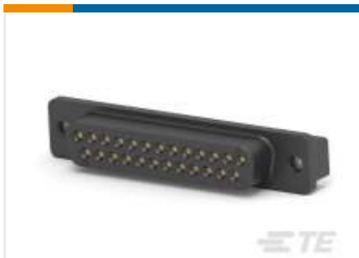
TE Part #1-5745967-6 D-Sub Receptacle Assembly: Vertical, Shell Size 3, 2.77mm