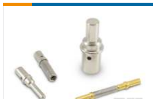
TE Part #0462-201-16141 DEUTSCH Solid Contacts