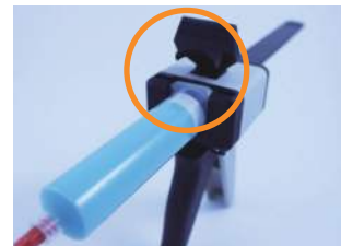
③ Close the cover.