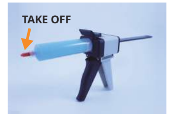
④ Take off the plug.

(The putty in the picture does not represent the actual product.)