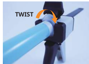
② Put the tube in and twist.