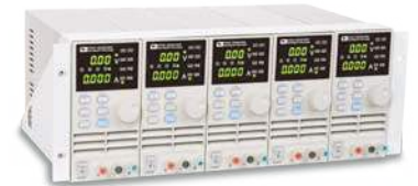
IT-E152 19" Rack Mount Diagram