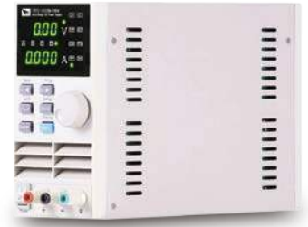
IT6720 60V/5A/100W IT6721 60V/8A/180W