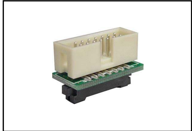
Figure 1 External View of the R0E000010CKZ00

The R0E000010CKZ00 allows connection of the E1 to a user system on which the only mounted connector is for the E20. However, the only available functions are those of the E1. Functions specific to the E20 are not available.