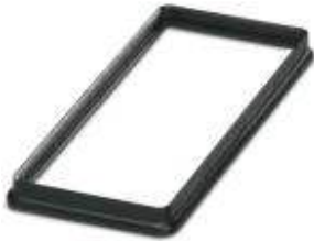
Profile gasket for sleeve housing type B16.....EEE

Please be informed that the data shown in this PDF Document is generated from our Online Catalog. Please find the complete data in the user's documentation. Our General Terms of Use for Downloads are valid ( http://phoenixcontact.com/download )