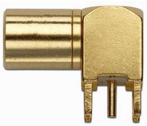
Model 72997 SMB PLUG R/A PCB RECEPTACLE