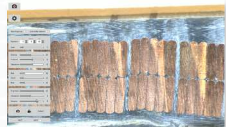
HDMI Mode: Image/Video Capture, On-Screen Tools (No PC required)