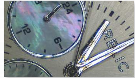
Excellent Color Reproduction