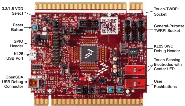
Figure 1: Front side of TWR-KL25Z48M board