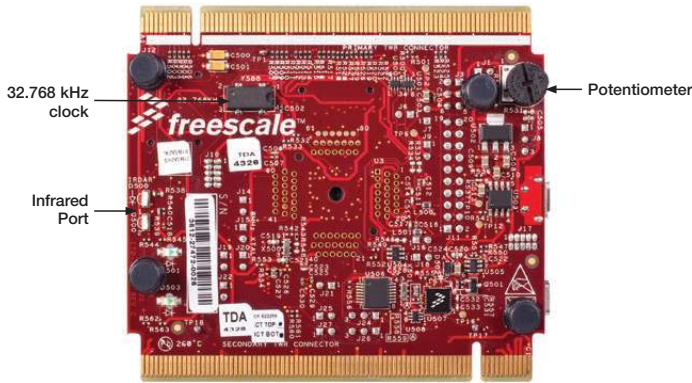
Figure 2: Back side of TWR-KL25Z48M board