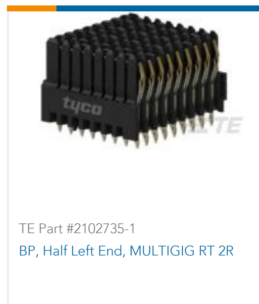
TE Part #2102735-1 BP, Half Left End, MULTIGIG RT 2R