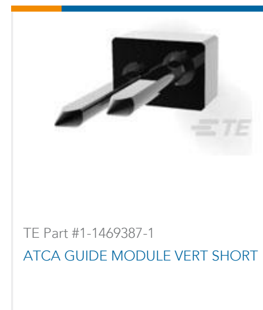
TE Part #1-1469387-1 ATCA GUIDE MODULE VERT SHORT