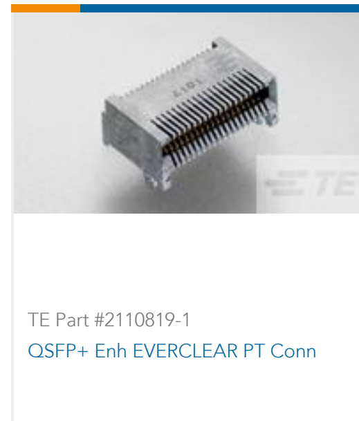
TE Part #2110819-1 QSFP+ Enh EVERCLEAR PT Conn