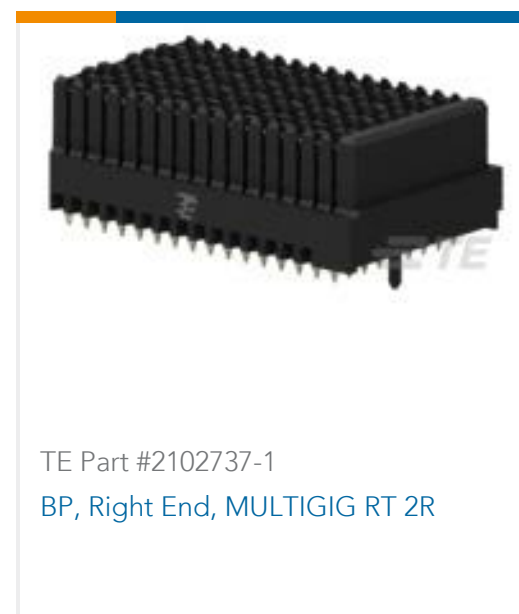
TE Part #2102737-1 BP, Right End, MULTIGIG RT 2R