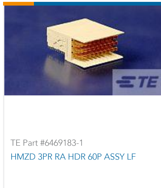
TE Part #6469183-1 HMZD 3PR RA HDR 60P ASSY LF