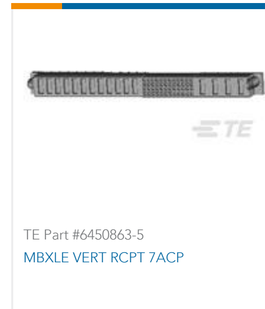
TE Part #6450863-5 MBXLE VERT RCPT 7ACP