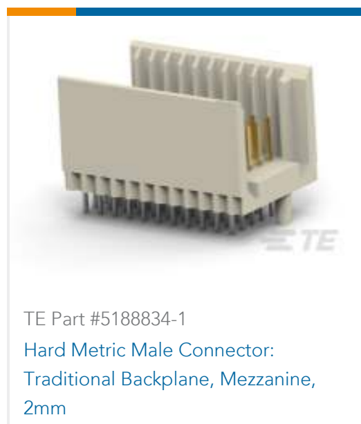
TE Part #5188834-1 Hard Metric Male Connector: Traditional Backplane, Mezzanine, 2mm