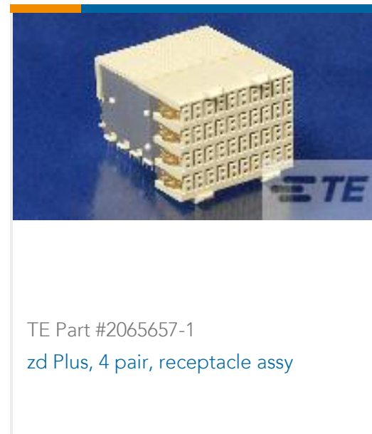
TE Part #2065657-1 zd Plus, 4 pair, receptacle assy