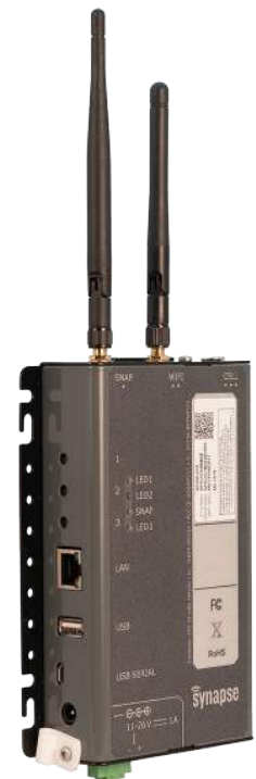
SS420 Site Controller