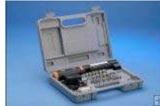
46-pc Power Screwdriver Kit