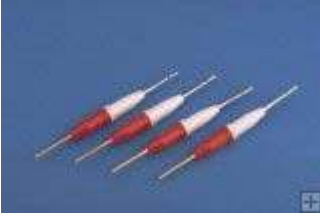
Pin and Socket Insertion/Extraction Tool