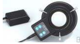
White LED Ring Light with Brightness and Sector Control