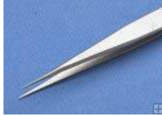
Tweezer Pattern 3C-CS