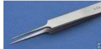
Tweezer Pattern 5-SA Technik