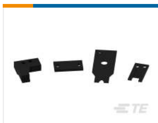
TE Part #1-356885-3 STOP, SHEAR