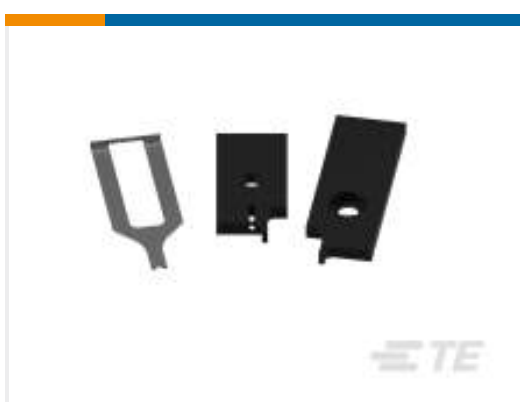
TE Part #2119791-7 Depressor, Wire