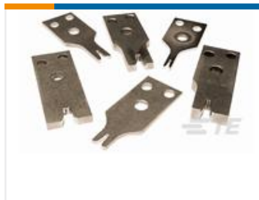
TE Part #4-456406-4 CRIMPER, WIRE .090 'F'