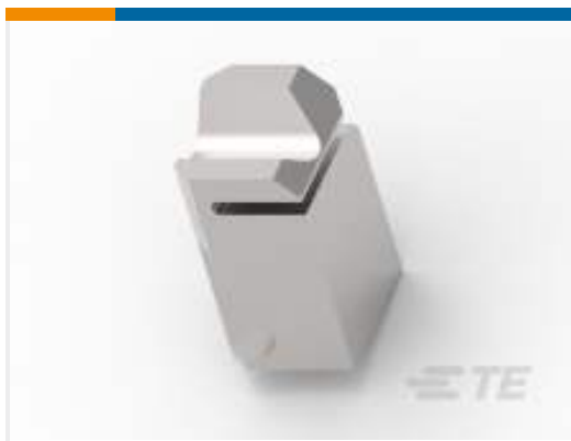
TE Part #1803095-6 FLOATING SHEAR, FRONT