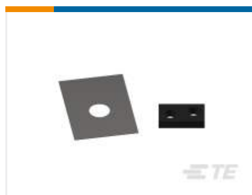
TE Part #1-455888-4 SPACER, CRIMPER((065)