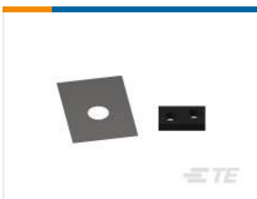
TE Part #238011-4 SPACER, BLOCK CRIMPER (.104)