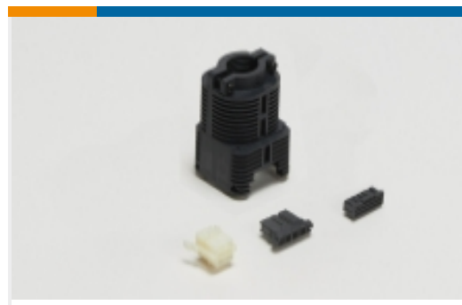
Rectangular Connector Housings(5)