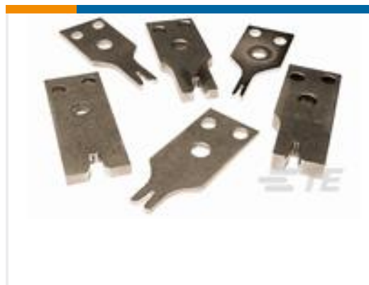
TE Part #1633965-2 CRIMPER, INSUL O PREMIUM