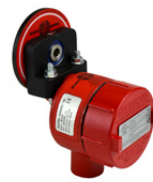
EZ-100 Mounting Option