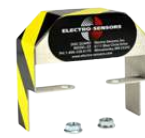
EZ-Mount Disc Guard