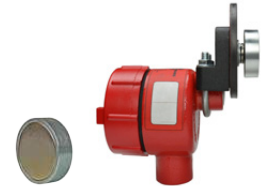
MM-2.00 Mounting Magnet Option (must be used with EZ-100)