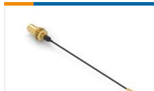
TE Part #2016682-4 RF CA,UMCC1 TO SMA JACK,1.13MM, L200MM