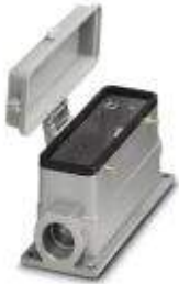
HEAVYCON box mounting base B24, for double locking latch, height 67 mm, with support 1xM25, with cover

Please be informed that the data shown in this PDF Document is generated from our Online Catalog. Please find the complete data in the user's documentation. Our General Terms of Use for Downloads are valid ( http://phoenixcontact.com/download )