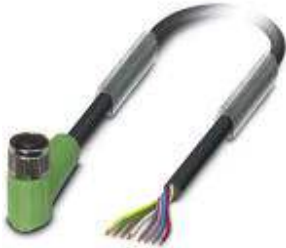
Sensor/Actuator cable, 8-position, PUR, Black RAL 9005, Free cable end, on Socket angled M8, Cable length: 10 m

Please be informed that the data shown in this PDF Document is generated from our Online Catalog. Please find the complete data in the user's documentation. Our General Terms of Use for Downloads are valid ( http://download.phoenixcontact.com )