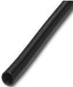
Polyamide protective hose, inflammability class V0, UV resistant

Please be informed that the data shown in this PDF Document is generated from our Online Catalog. Please find the complete data in the user's documentation. Our General Terms of Use for Downloads are valid ( http://phoenixcontact.com/download )