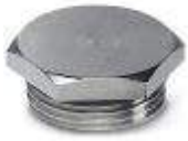
Filler plug, metal, size: M25