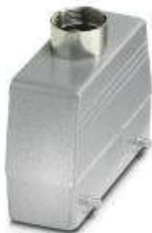
HEAVYCON sleeve housing HV10/16, for double locking latch, height 76 mm, with support 1x M25, straight conductor exit

Please be informed that the data shown in this PDF Document is generated from our Online Catalog. Please find the complete data in the user's documentation. Our General Terms of Use for Downloads are valid ( http://phoenixcontact.com/download )