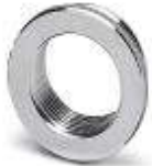
Step-down adapter, M25 to M20, including O-ring

Reducing adapter - REDUC-M-KV-M25/M20 - 1647624