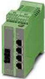
Ethernet Lean Managed Switch with four 10/100 Mbps RJ45 ports and one 10/100 Mbps FX-ST single-mode port

Please be informed that the data shown in this PDF Document is generated from our Online Catalog. Please find the complete data in the user's documentation. Our General Terms of Use for Downloads are valid ( http://phoenixcontact.com/download )