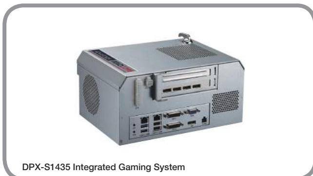
DPX-S1435 Integrated Gaming System