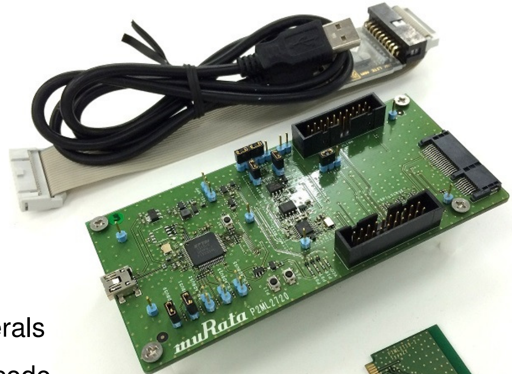
Design Kit Motherboard