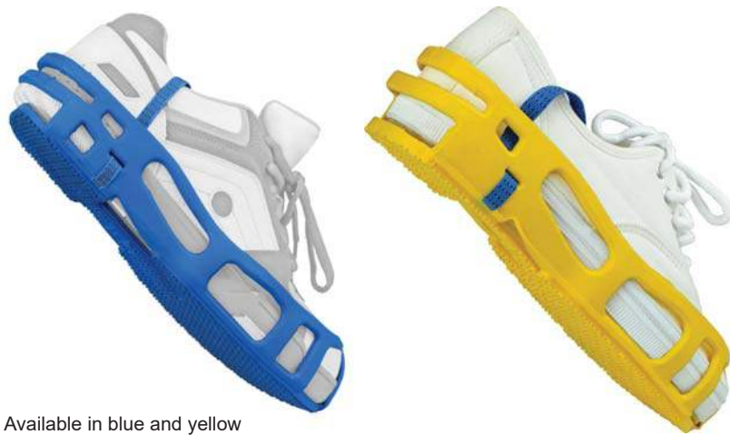
Available in blue and yellow