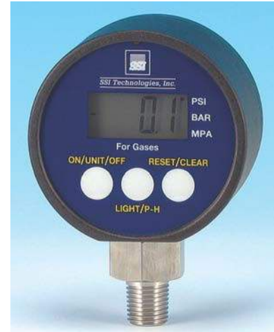
MediaGauge™ Model MG-9V and Model MG-9V-F

The MediaGauge™ MG-9V digital pressure gauge has better accuracy, longer life and standard multiple functions which make it a better choice than mechanical pressure gauges.