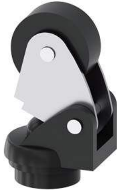
Actuator head for position switch 3SE51 Roller lever Stainless steel lever and Plastic roller 22 mm