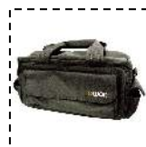
Soft Bag (optional)